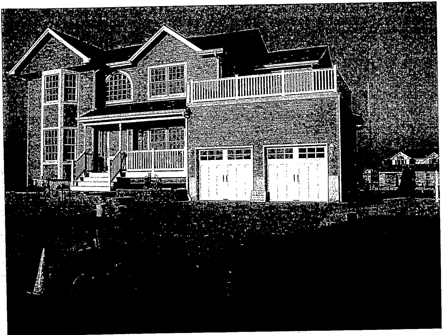
FRONT VIEW (12/20/07)

If using the Elevation Certificate to obtain NFIP flood insurance, affix at least two building photographs below according to the instructions for Item A6. Identify all photographs with: date taken; "Front View" and "Rear View"; and, if required, "Right Side View" and "Left Side View." If submitting more photographs than will fit on this page, use the Continuation Page, following.