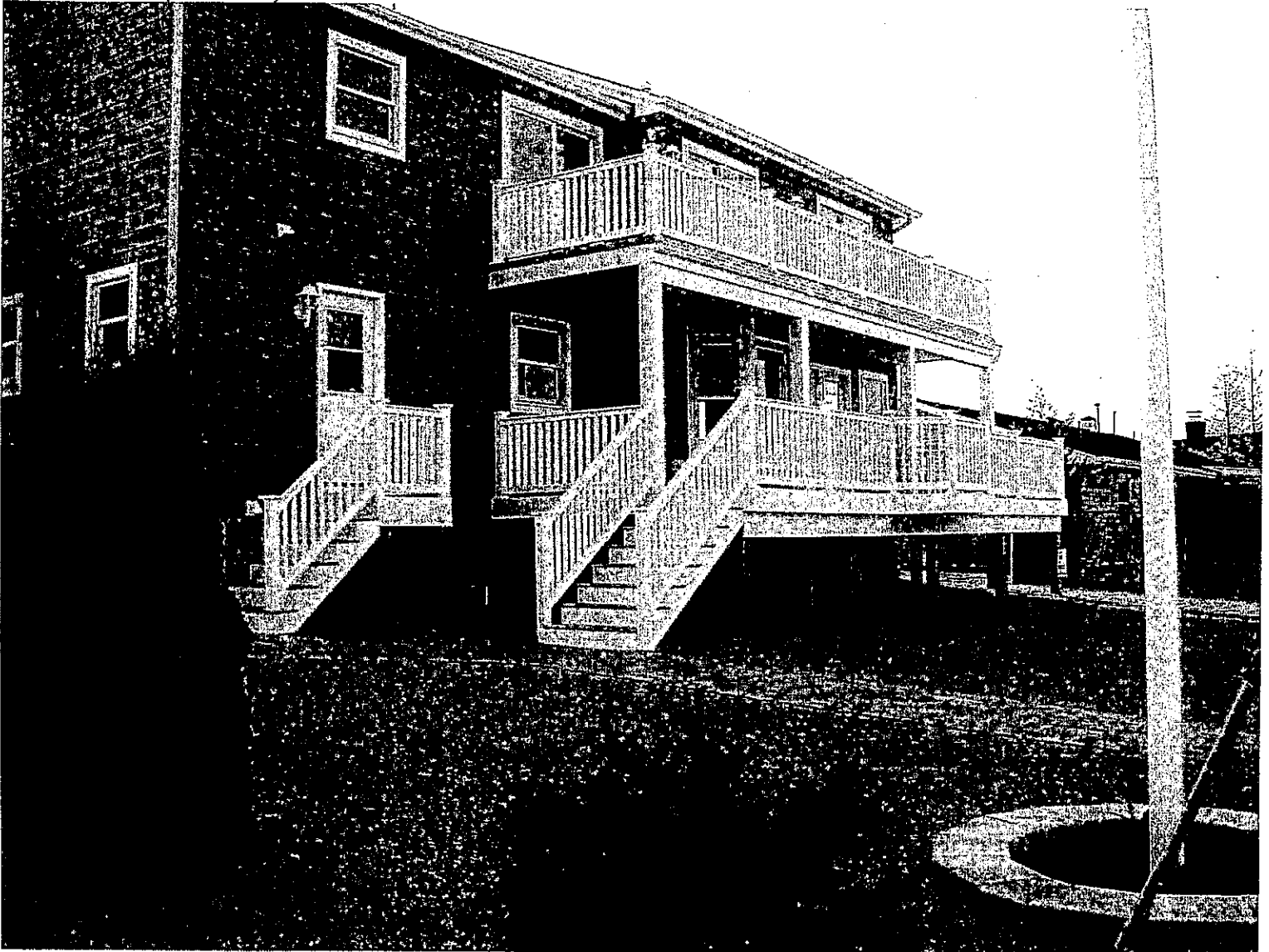
REAR VIEW (12/20/07)